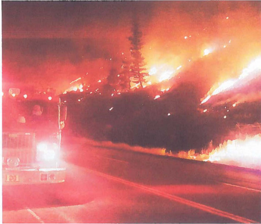
BFD on night operations on highway 97 between Cache Creek and Loon Lake Rd

To: Public Safety Committee From: Director Public Safety and Community Services Re: City of Burnaby Wildfire Support 2018 Jan 23..... Page 4