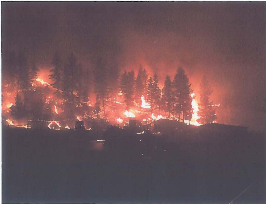
BFD on night operations protecting a ranch on Loon Lake Rd