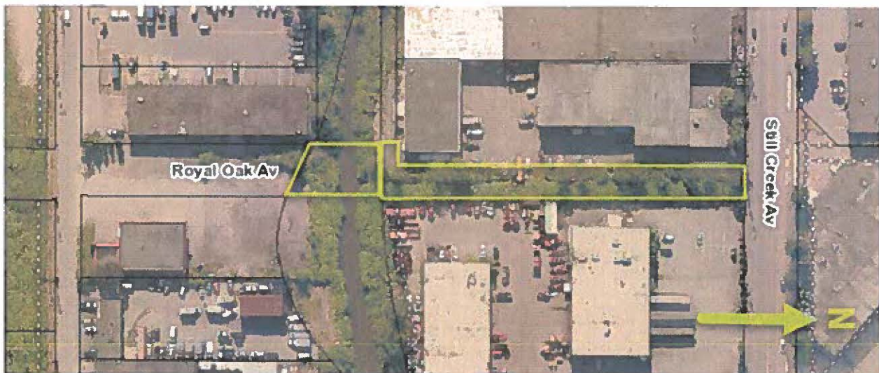
Figure 2 – Location of proposed Metro Vancouver watermain under Elk Creek

With respect to Project M1 – Still Creek Area, Metro Vancouver plans to install their watermain via deep micro-tunneling under Elk Creek, between Still Creek Avenue and Still Creek, in order to eliminate any environmental disturbance to this watercourse. Figure 2 shows Metro Vancouver’s proposed watermain in relation to Elk Creek. Metro Vancouver has submitted and received approval from the City’s Environmental Review Committee (ERC) on 2017 December 11 that this is an acceptable construction methodology.