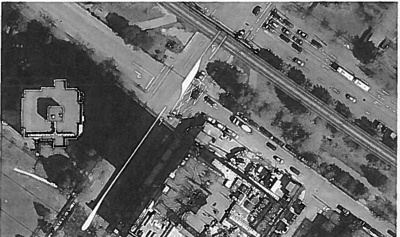
Figure 3: Recommended Modifications at Beresford/Willingdon

Based on the above three alternatives, the recommended approach to resolve current safety and operational issues is to make minor geometric modifications as outlined in Option C. The proposed median along Willingdon provides a balanced approach where the most problematic traffic movements are prohibited, while maintaining some access in and out of Beresford.