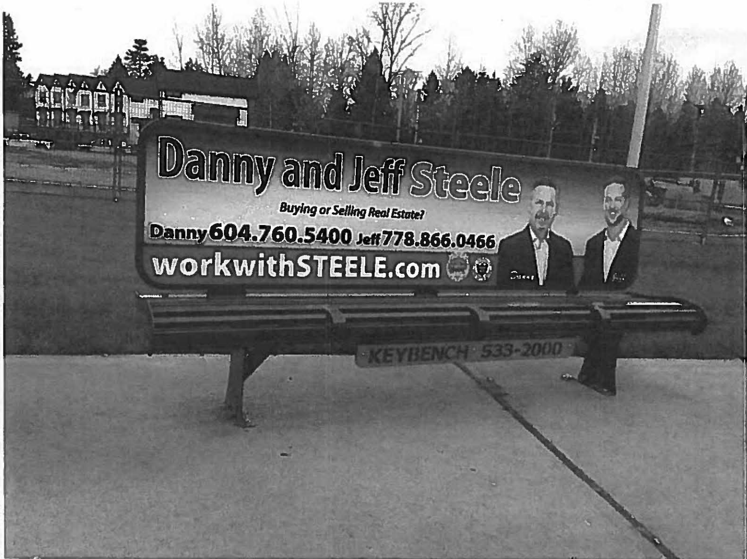
FIGURE - 2