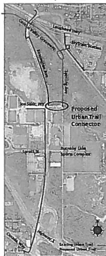
Figure 3: Burnaby Lake Urban Trails

The trail provides local community access and connection to the Bill Copeland Sports Centre, CG Brown Memorial Pool, Burnaby Lake, Burnaby Lake Sports Complex, Deer Lake Park and Civic Complex, Central Valley Greenway, Sperling / Burnaby Lake SkyTrain Station and bus stops. This short section is the missing pedestrian and cyclist link in existing Urban Trails extending from Canada Way to the Lougheed Highway ( Figure 3 ), and would provide safe means for users to connect east-west.