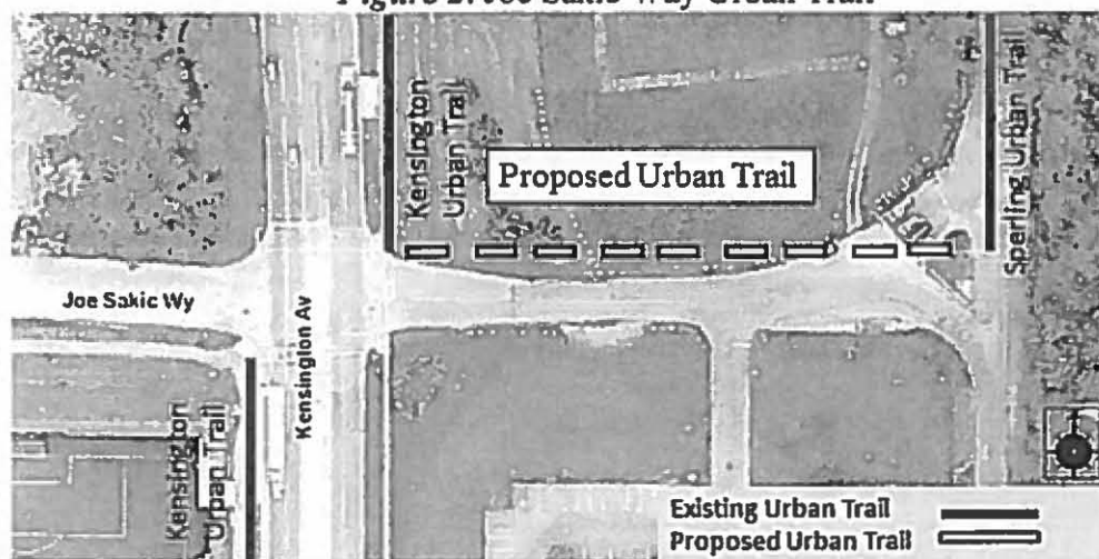
Figure 2: Joe Sakic Way Urban Trail

The trail provides local community access and connection to the Bill Copeland Sports Centre, CG Brown Memorial Pool, Burnaby Lake, Burnaby Lake Sports Complex, Deer Lake Park and Civic Complex, Central Valley Greenway, Sperling / Burnaby Lake SkyTrain Station and bus stops. This short section is the missing pedestrian and cyclist link in existing Urban Trails extending from Canada Way to the Lougheed Highway ( Figure 3 ), and would provide safe means for users to connect east-west.