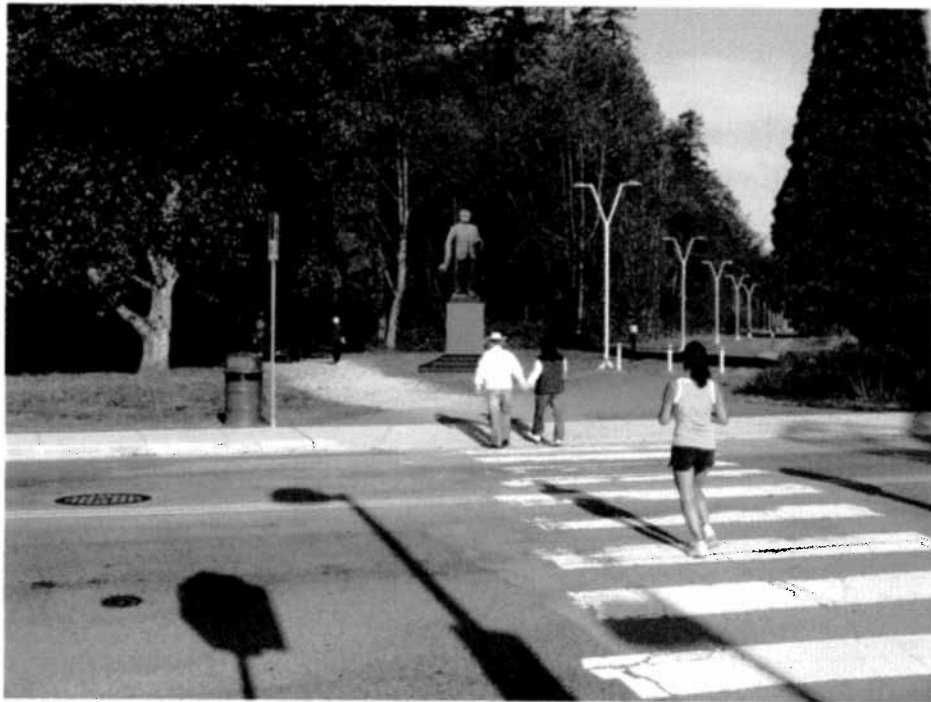
Illustration of potential statue orientation towards Patterson Avenue and Beresford Street.