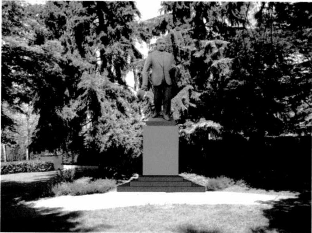
Illustration of potential statue orientation in northeast corner of Civic Square