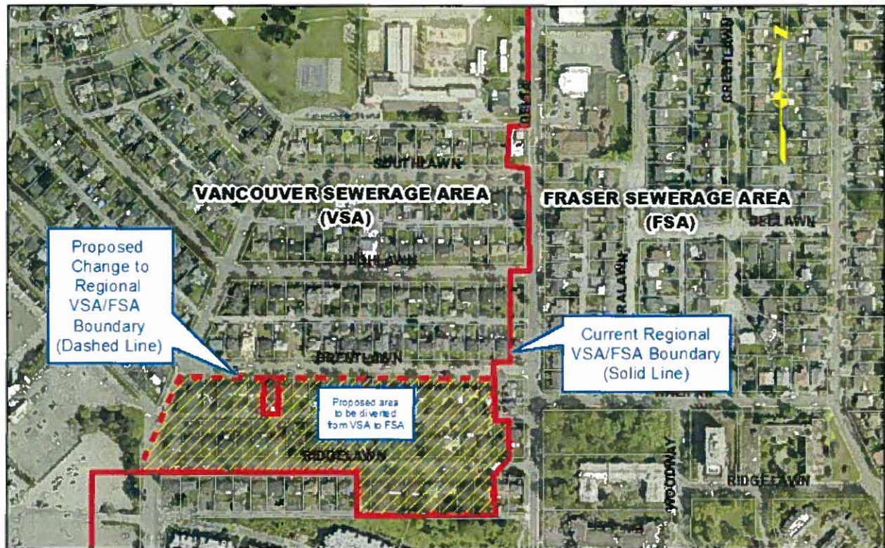
Figure 2. Proposed Sewerage Area Boundary Change for Brentlawn Drive

As such, this proposed servicing strategy requires a change to the Regional Sewerage boundary as shown in Figure 2 . An amendment to the Regional VSA/FSA boundary is needed and, consequently, approval from Metro Vancouver for this amendment.