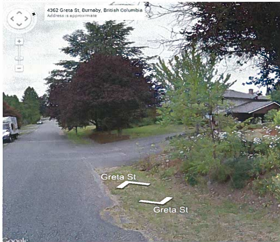
Picture of boulevard with three to four plum trees in front of 4329 Greta Street (Before)