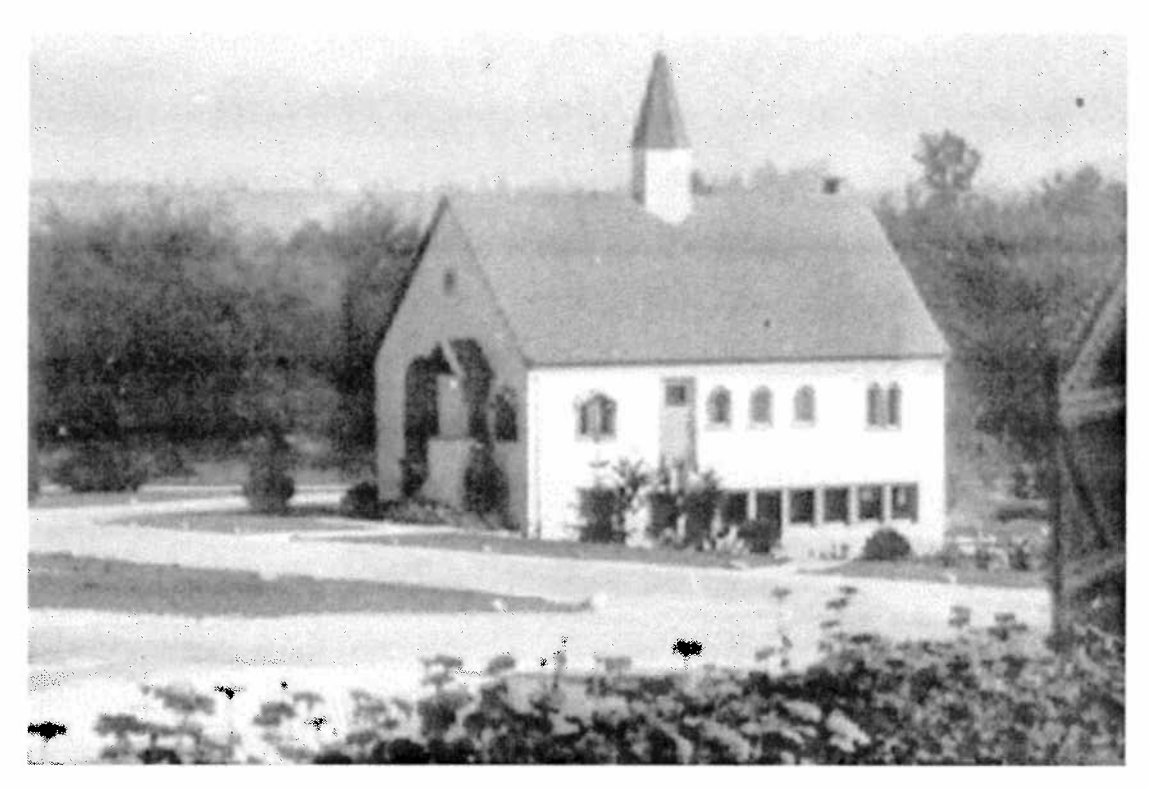
Chapel of Peace, Forest Lawn Memorial Park Royal Oak Avenue and Sprott Street, c.1935