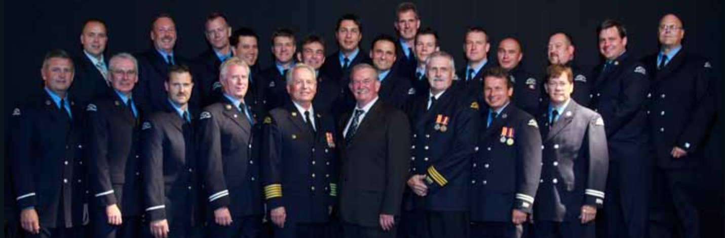
2010 LONG SERVICE AWARDS