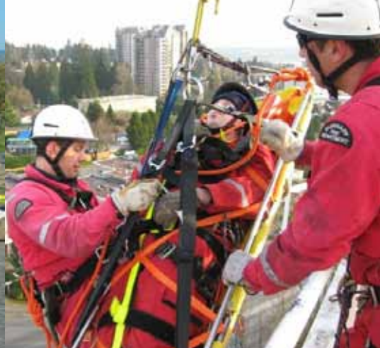
TOWER CRANE RESCUE TRAINING