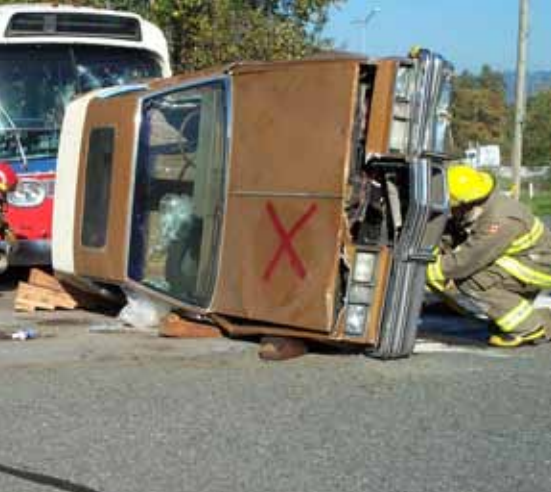
AUTO EXTRICATION TRAINING