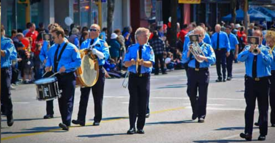
HATS OFF DAY PARADE