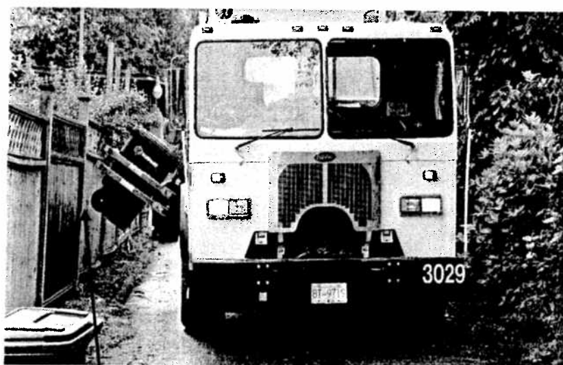
6 inches clearance from the fence

The new automated trucks require a working width of 3.6m (11.8 ft.) for toter pickup on one side. An additional 0.7m (2.3 ft.) clearance is required if toters are placed on both sides of the lane. Previously when the containers were placed on both sides of the lane by residents on Rumble Street and on Neville Street, the driver had to manually move some of the toters to a central location for access by the truck. An investigation of the site condition was carried out by the division supervisor in April 2010 and confirmed that operational changes to the collection are warranted. Subsequently in May 2010, a letter requesting a change from lane pickup to front street pickup was delivered to all residents on the south side of 4500 block Rumble Street and on the north side of 4500 block Neville Street. The following photos show the width of the subject lane and the limited clearance available with toters located on one side of the lane only.