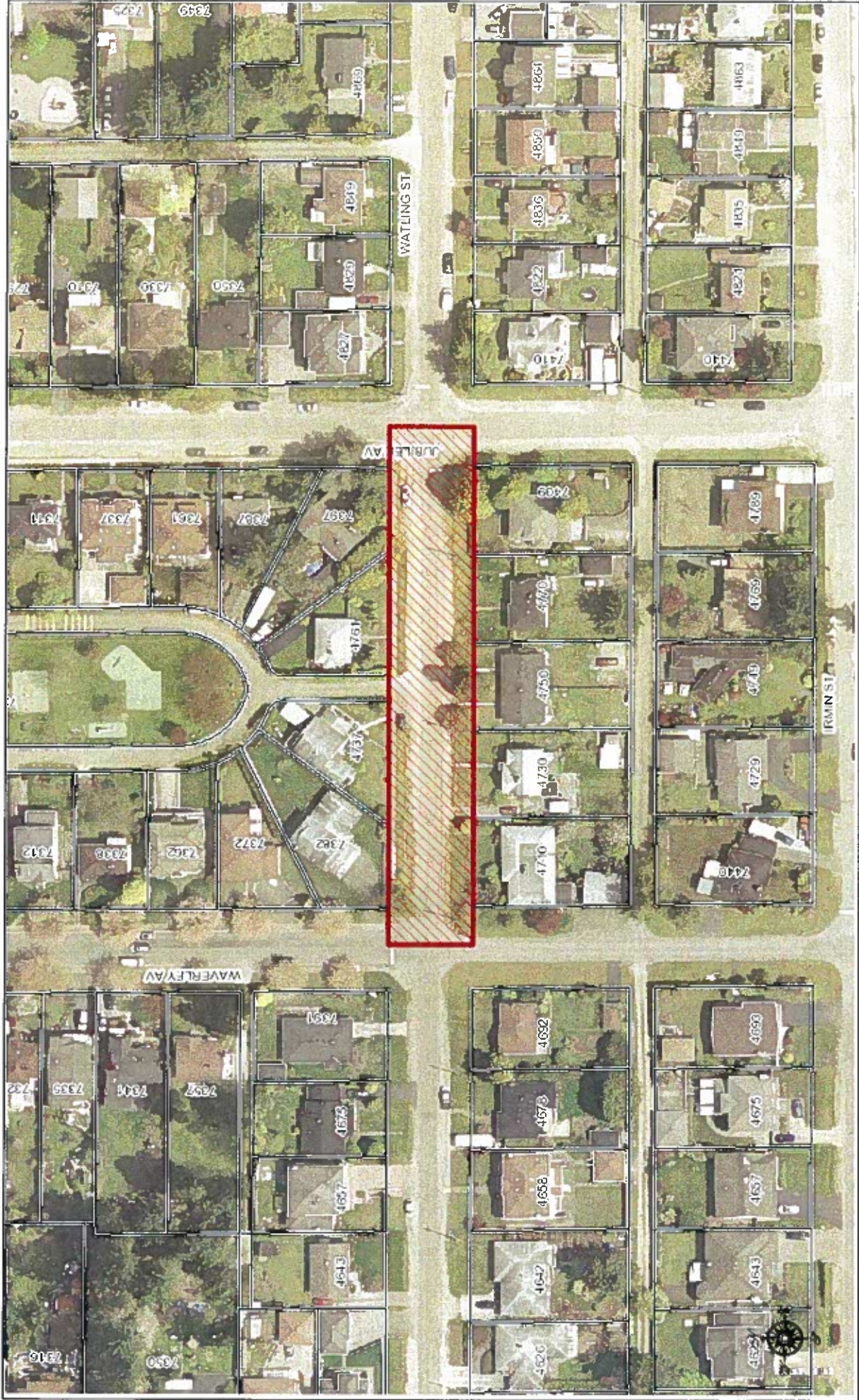
Alternate Street Design Pilot Project - 4700 Block Watling Street

This information has been gathered and assembled on the City of Burnaby's computer systems. Data provided herein is derived from a number of sources with varying levels of accuracy. The City of Burnaby disclaims all responsibility for the accuracy or completeness of information contained herein.