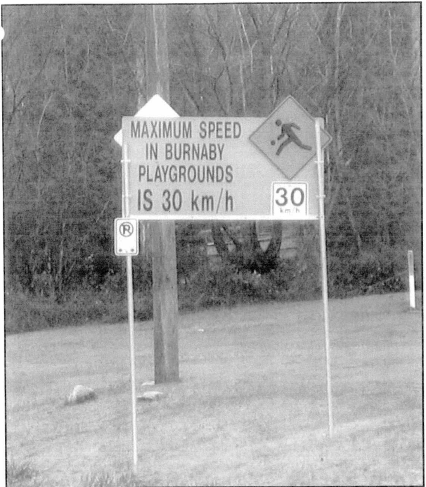
Figure 2 Oversized Park Zone Warning Sign