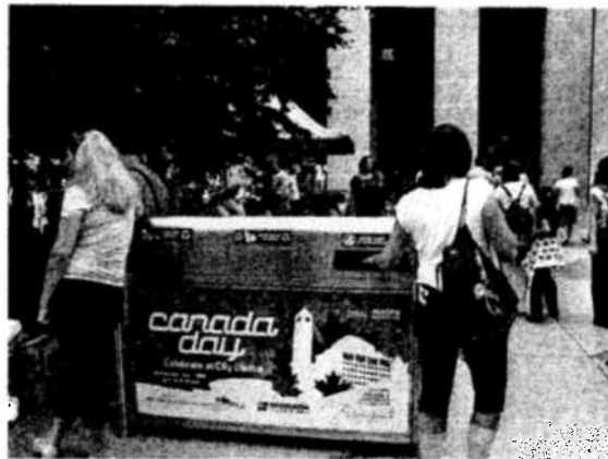
Figure 1: SilverBox

EcoMedia Direct Inc. is a Canadian company specializing in public space recycling and outdoor advertizing programs. It has agreements with the City of Toronto, Markham and the Toronto School District amongst others and operates more than 3,600 of their patented SilverBox recycling units (see Figure 1). During the 2009 World Police and Fire Games, EcoMedia had also provided garbage and recycling units to the game organizers to be used at various event sites. Staff inspection of these units at that time showed that they were well received and used even in absence of targeted communication efforts.