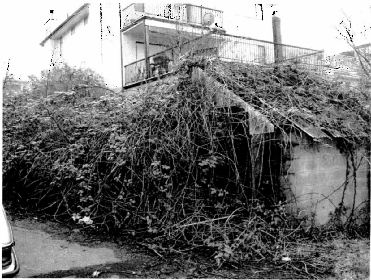
Shed/outbuilding at laneway