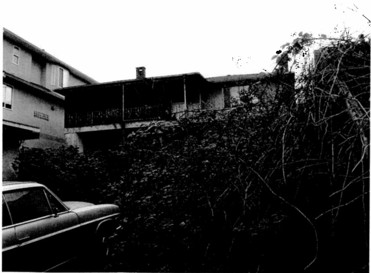
Shot from the lane