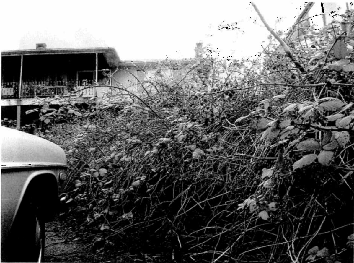
115 Shot from laneway towards the rear of the house