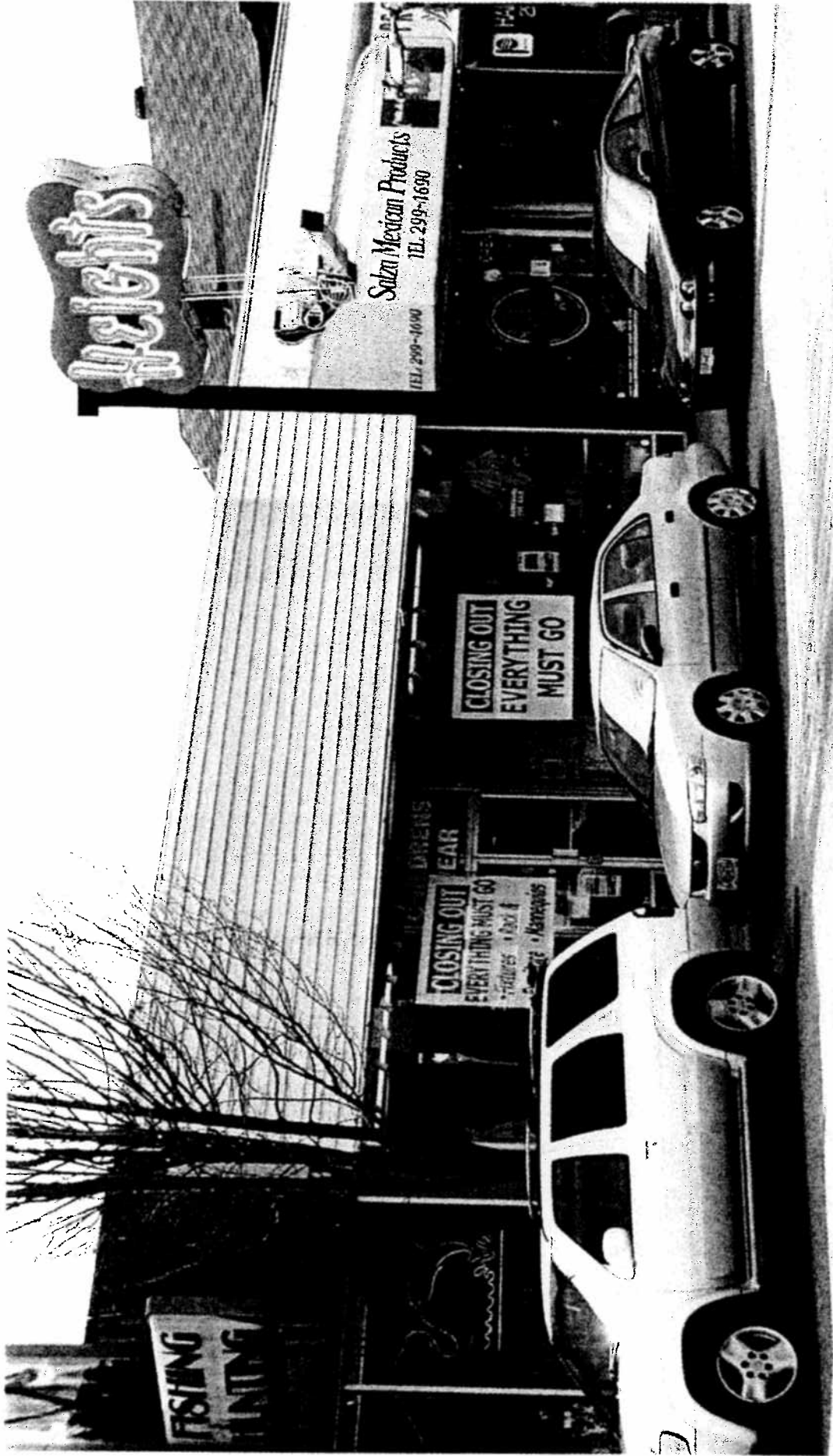
Attachment 1 Propoc Sign Stand and location at 4142 Hastings Street