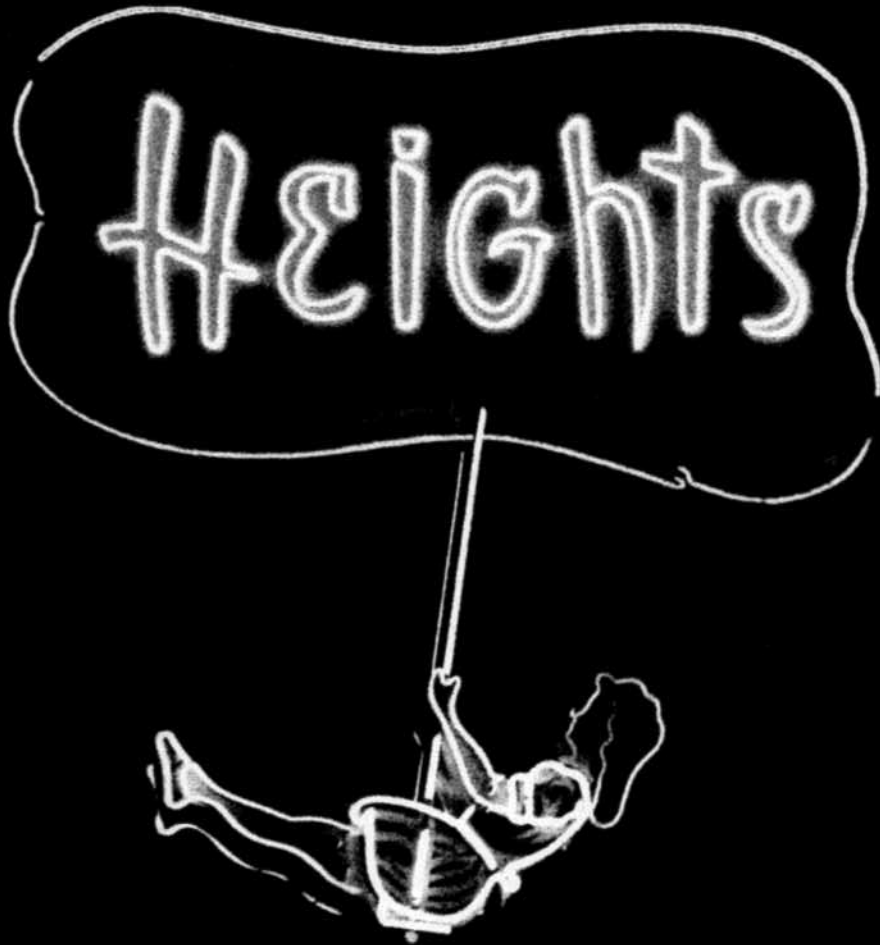
Attachment 2 Proposed design change for the "Swinging Girl" neon sign