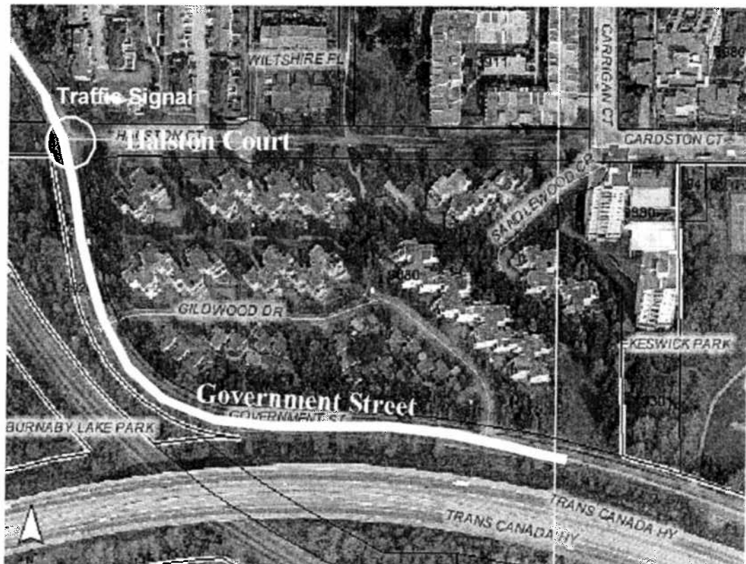
Figure 1 REZONING REFERENCE #04-18 Transportation Servicing