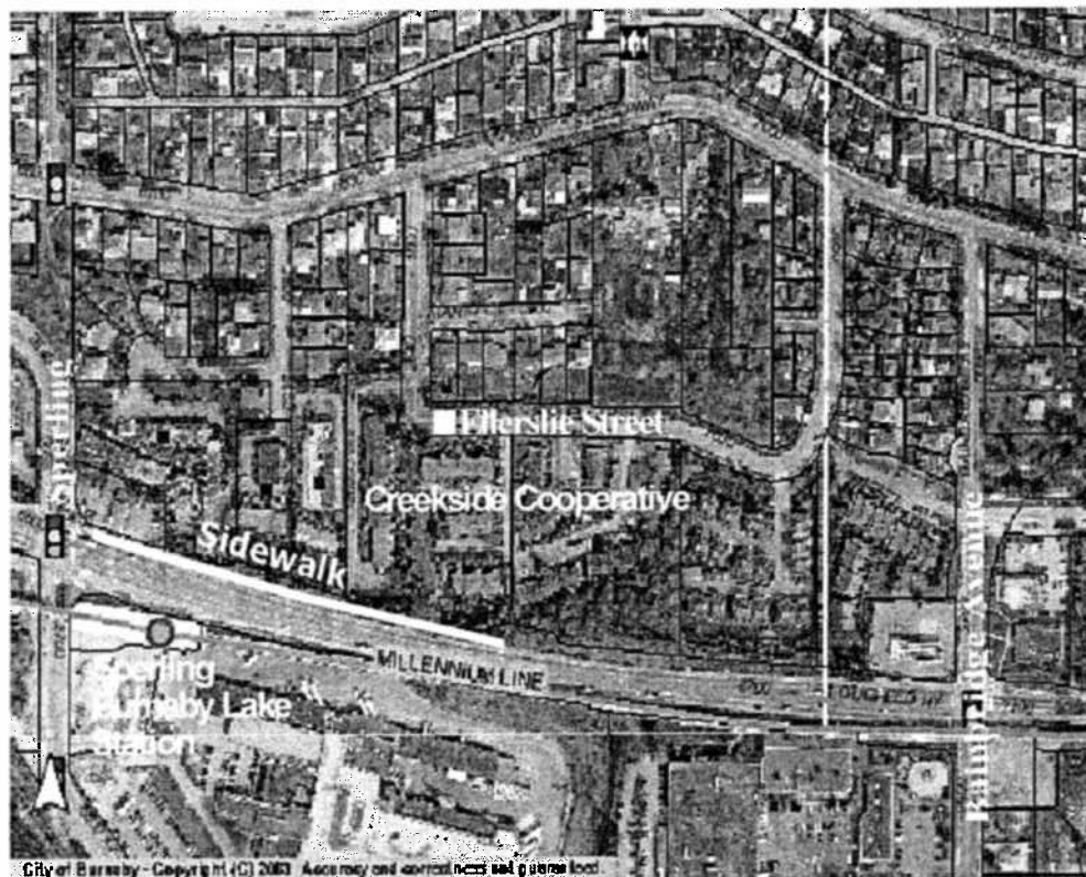
Figure 1 Creekside Cooperative to Sperling Sidewalk

In the 2003, June 16 report to Council, Sperling/Burnaby Lake was one of the stations that was identified as being deficient in sidewalk connections to/from the station. Sidewalk connections were needed on both sides of Lougheed Highway between Bainbridge and Sperling. In 2004, a sidewalk was constructed on the south side of the Lougheed Highway from Sperling to Bainbridge. However, a significant number of pedestrians to and from the station originate from the Creekside Cooperative townhouse development shown in Figure 1 which can only be adequately served by a sidewalk located on the north side of the highway.