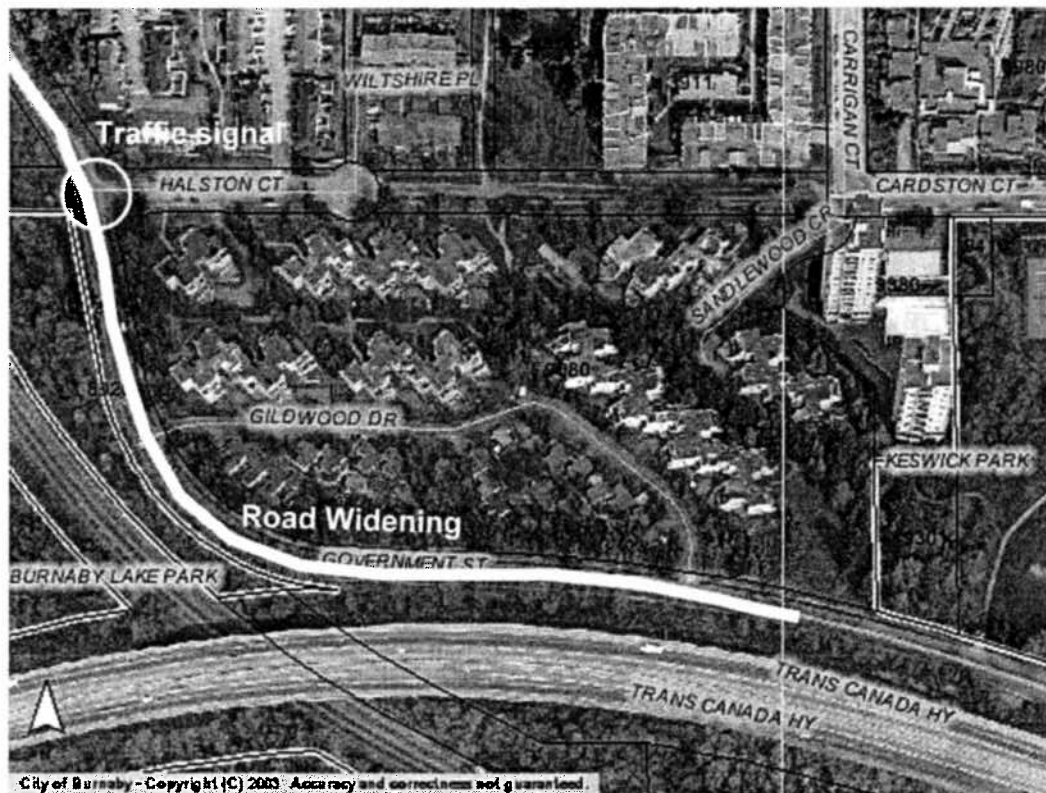
Figure 1 Rezoning #04-18 Transportation Servicing

Government Street in this area is designated as a Major Collector (primary). Providing this new standard in conjunction with the development on the north side avoids the higher costs of the City being responsible for widening on the south side at a later date and also results in preserving a number of large deciduous trees which currently provide a buffer between the development and the freeway on the south side.