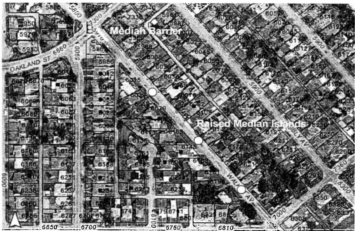
Figure 2 Walker Avenue: Interim Traffic Calming Measures

Figure 2 shows the approximate location of the temporary median barrier and the raised median islands as favoured by the residents. These islands have also been marked out in the field. These measures are not expected to address the issue of excessive traffic volumes on Walker, or the issue of the imbalance of traffic relative to Sperling, but should slow traffic and improve safety on Walker Avenue.