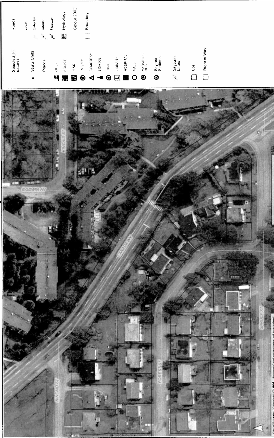
Exhibit 1 Canada Way - 4800 Block

The information in BurnabyMap has been gathered and assembled on the City of Burnaby's Computer Systems. Data provided herein is derived from a number of sources with varying levels of currency and accuracy. The City of Burnaby disclaims all responsibility for the accuracy or completeness of information contained herein.