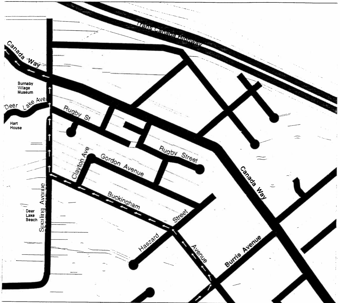
Figure 1 Buckingham Heights Traffic Infiltration Route