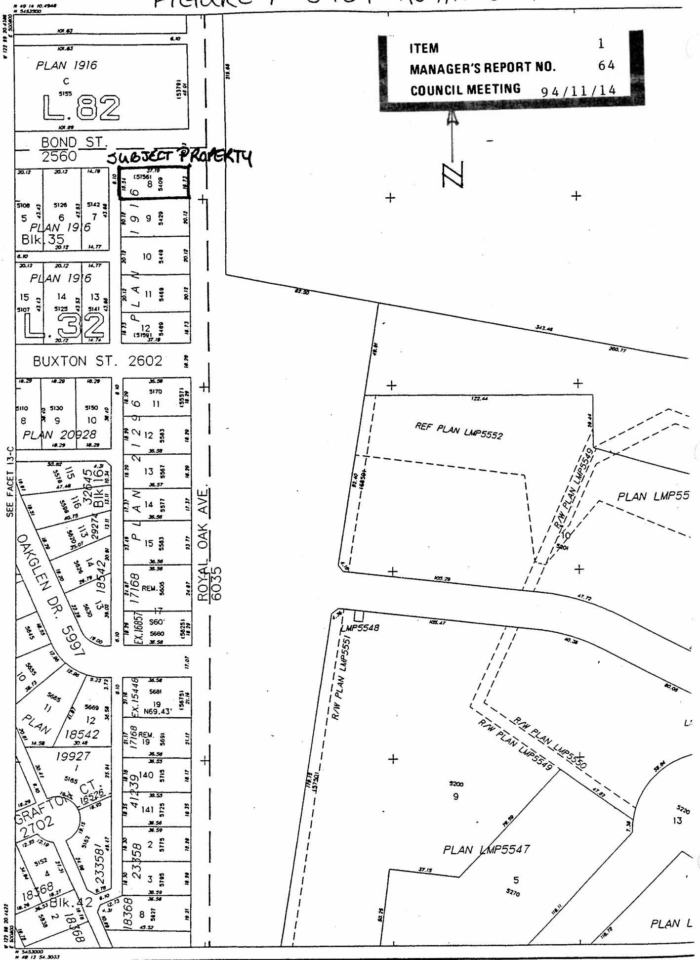
FIGURE 1- 5404 ROYAL OAK AVENUE

ITEM 1 MANAGER'S REPORT NO. 64 COUNCIL MEETING 94/11/14