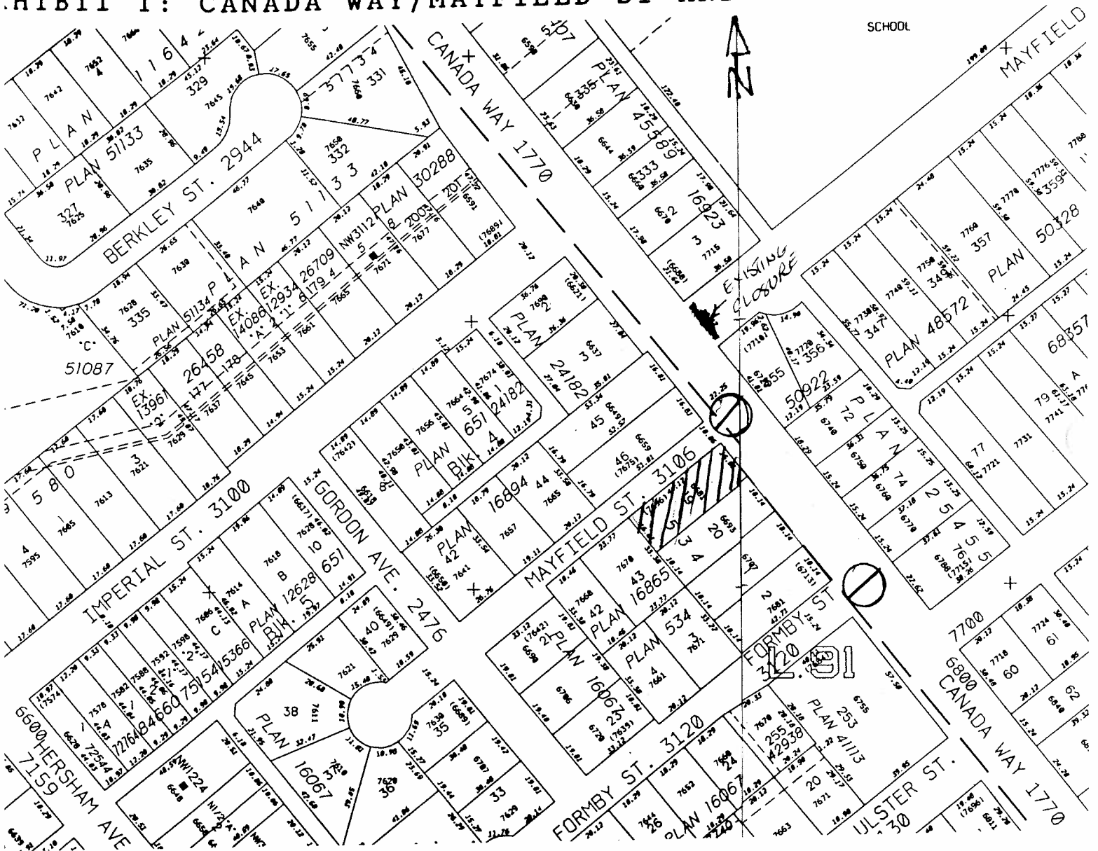
EXHIBIT 1: CANADA WAY/MAYFIELD ST AND ENVIRONS

ITEM 5 MANAGER'S REPORT NO. 70 COUNCIL MEETING 93/11/29