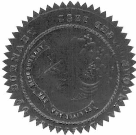
M A Y O R

Reconsidered and adopted by an affirmative vote of at least two-thirds of all the members of the Council this 30th day of December, 1974.