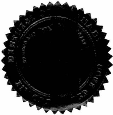
R E E V E .