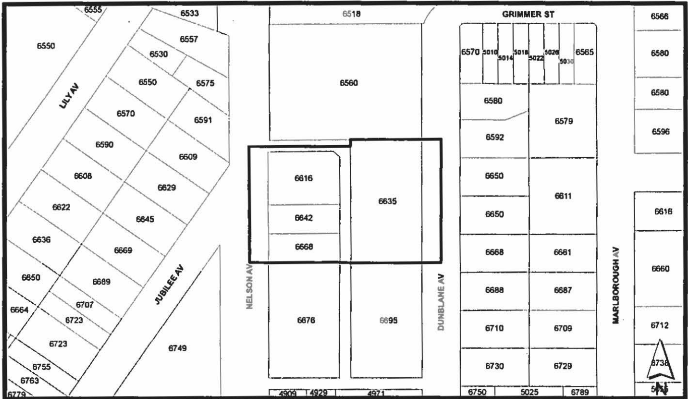
THE AREA(S) SHOWN ABOVE OUTLINED IN BLACK (——) IS (ARE) REZONED

LEGAL: Lot 41, DL 152, Group1, NWD Plan 26339; Lot 17, DL 152, Group 1, NWD Plan 8063; Lot 10, DL152, Group 1, NWD Plan 7803; Lot 52, DL 152, Group 1, NWD Plan 35494