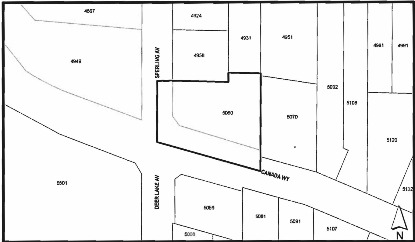
THE AREA(S) SHOWN ABOVE OUTLINED IN BLACK (————) IS (ARE) REZONED

LEGAL: Lot 1, DL 85, Group 1, NWD Plan LMP42276