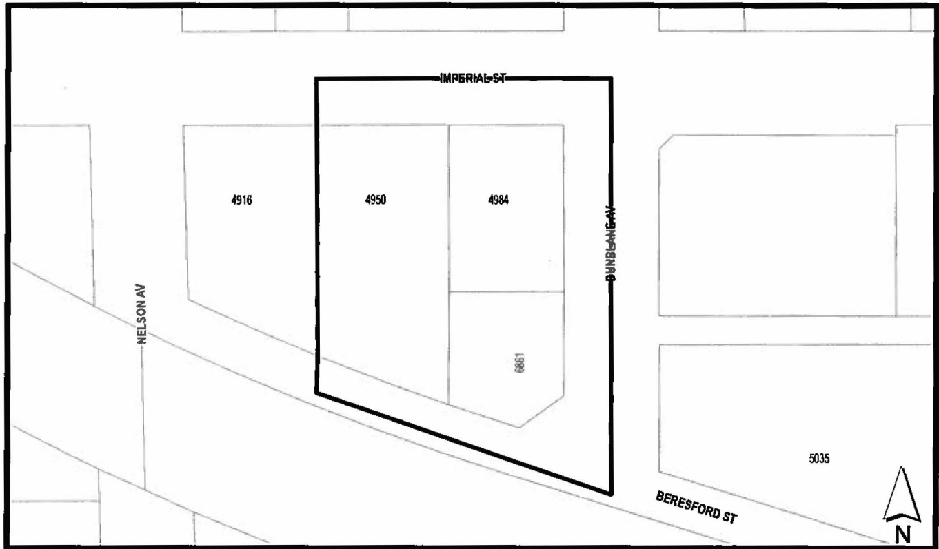
THE AREA(S) SHOWN ABOVE OUTLINED IN BLACK (——) IS (ARE) REZONED

LEGAL: Lot 1, Except PCL "B" (Explanatory Plan 11325), Blk 10, DL 98, Group 1, NWD Plan 8184; Lot 2, Except: North 115 Feet, DL 98, Group 1, NWD Plan 8184; the North 115 Feet of Lot 2, Blk 10, DL 98, Group 1, NWD Plan 8184