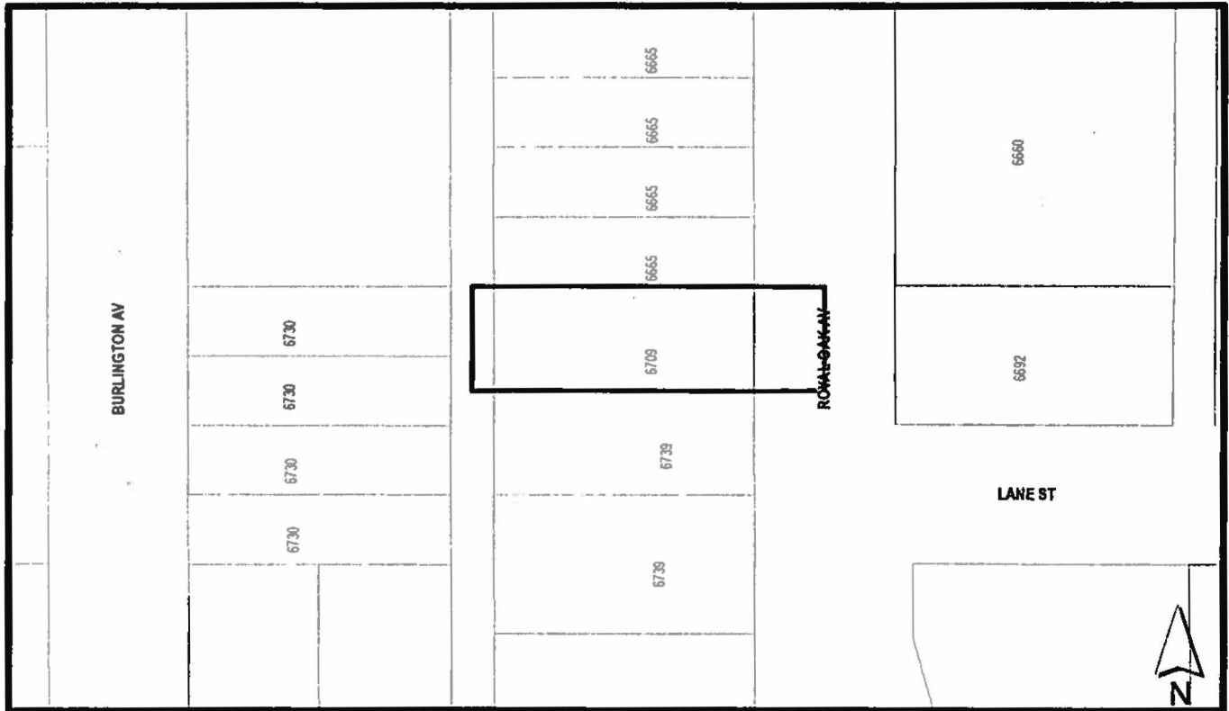
THE AREA(S) SHOWN ABOVE OUTLINED IN BLACK (——) IS (ARE) REZONED

LEGAL: The North Half Lot "F", D.L. 152, Group 1, NWD Plan 10076