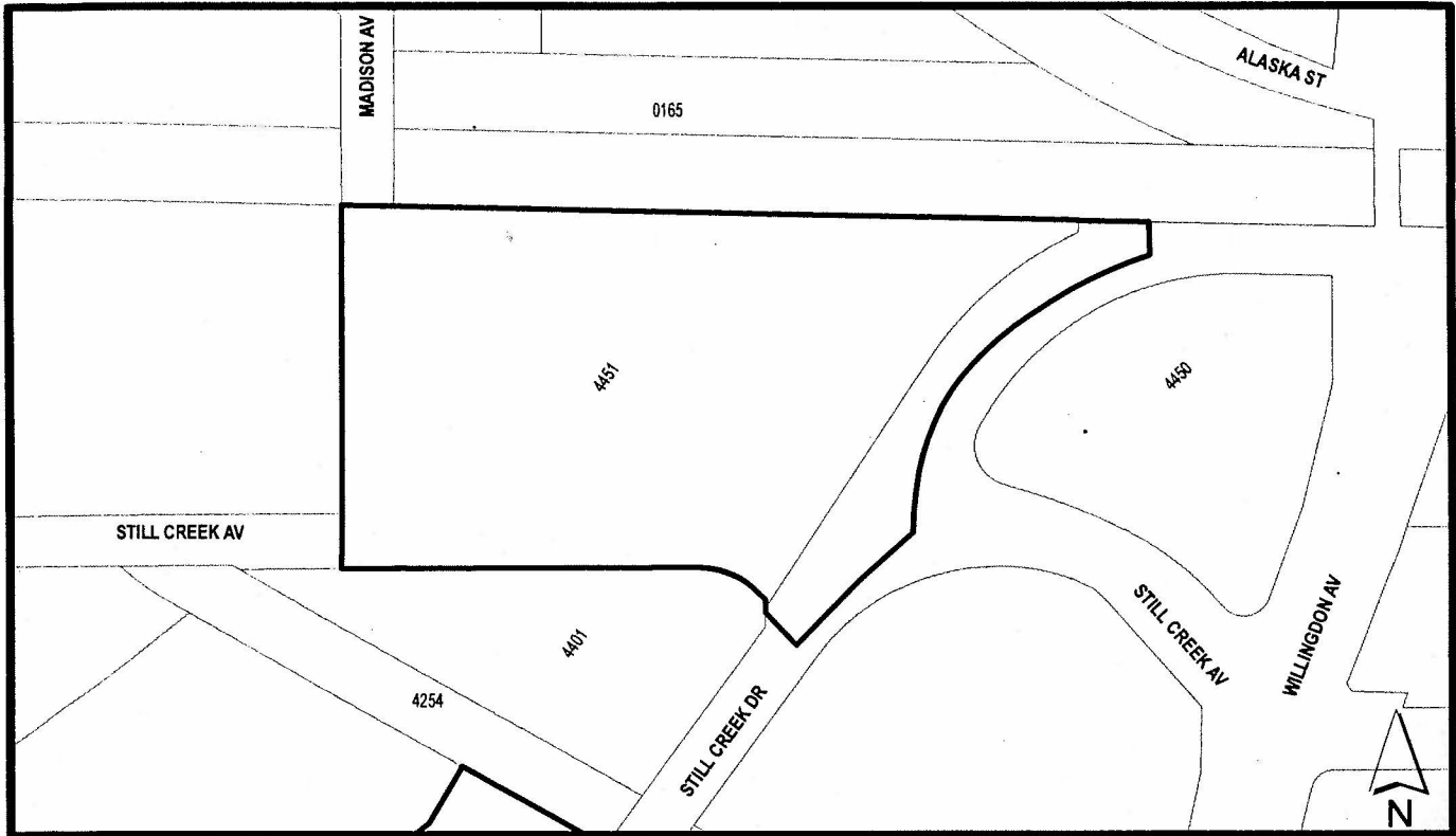
THE AREA(S) SHOWN ABOVE OUTLINED IN BLACK (——) IS (ARE) REZONED

LEGAL: Lot 4, D.L.'s 70 & 119, Group 1, NWD Plan BCP25458