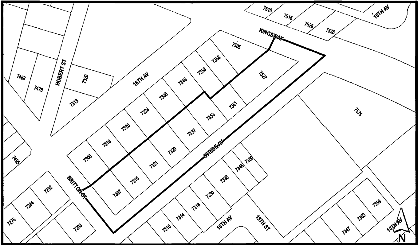
THE AREA(S) SHOWN ABOVE OUTINED IN BLACK (——) IS (ARE) REZONED