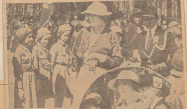
Her Excellency With the Guides and Brownies