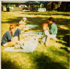
"International" Camp 1968