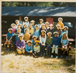
1970 - Western Camp.