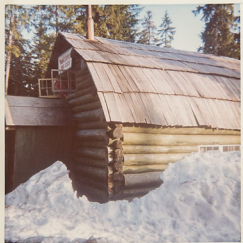
Our Chalet 1964 Weekend with Socona Girl Scouts