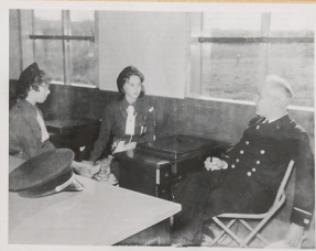
Ladies - Fire Department Badges.