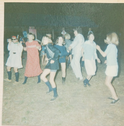
Camp - "H.M.S. Swirriges" 1967