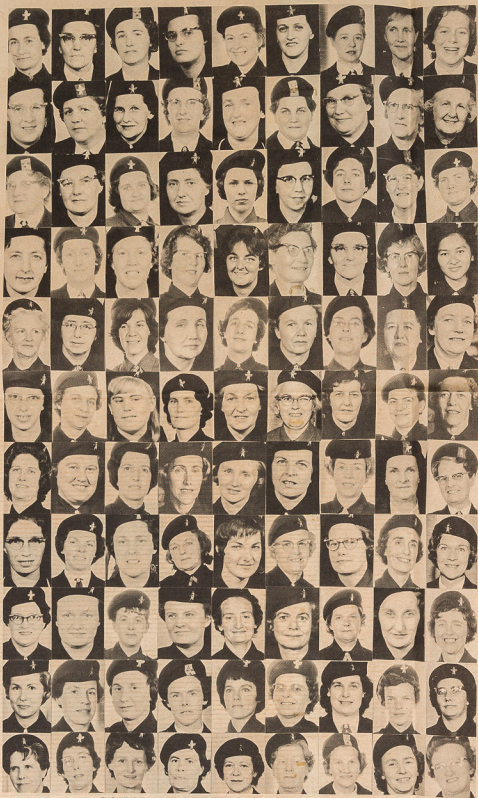
BURNABY'S GIRL GUIDE LEADERS