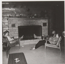
Weekend at Soona 1967