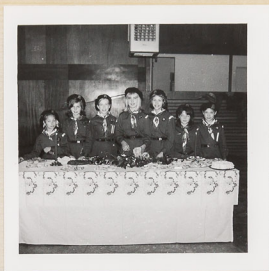
Christmas Hostess Party