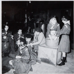
Roll, mend, wash & Lion - used Guide & Beavette uniforms to send to Indian Scribes in the North.