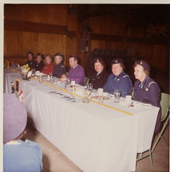
Sixth Mother & Daughter Banquet 1965