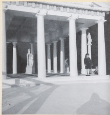
Visit - by Scout Patrol and Leaders to the "Parthenon" Greek Temple in West Vancouver 1967