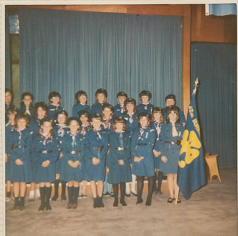
1965 - Company 20 Guides