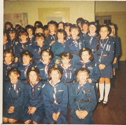
1967 - Company 30 Guides

Visit to - Zeigler's Castle St. Langley 17 Miles SW of Burrus, Texas 1967