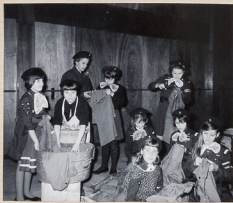
Guide & Beavette "Centennial Project"