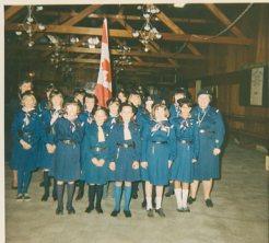
1966 - Company 76 Guides