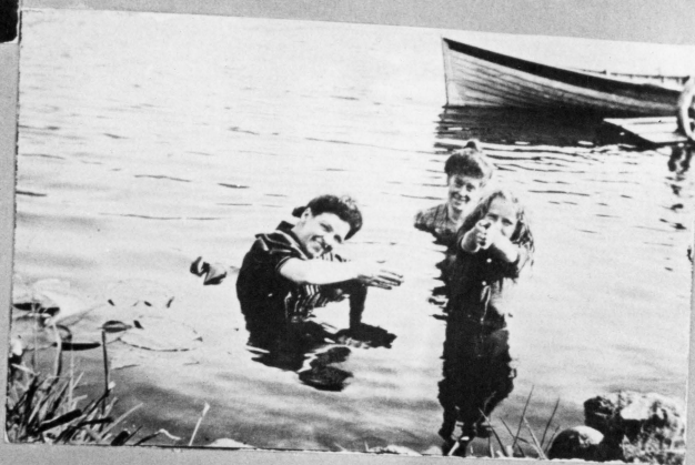
He can't swim