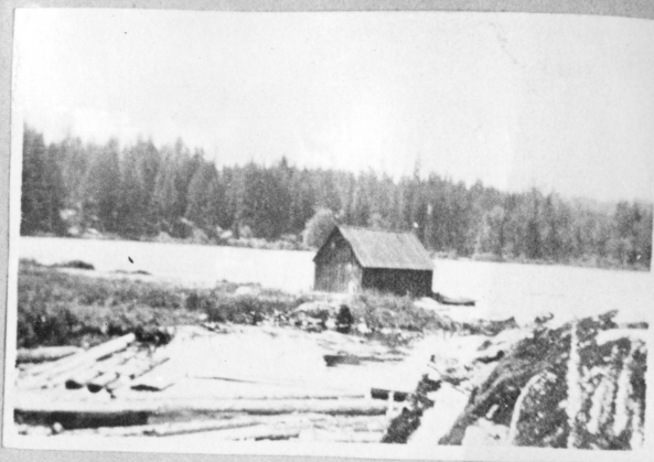
Running a bluff.