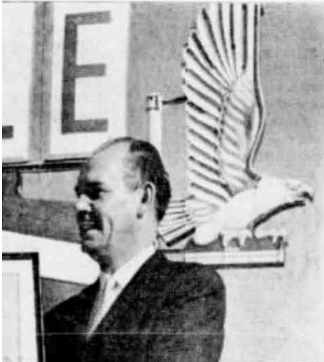
One of the earliest images of the Burnaby Eagle from the Vancouver Province in 1966 showing the body of the bird in white and still perched on the Richfield base.