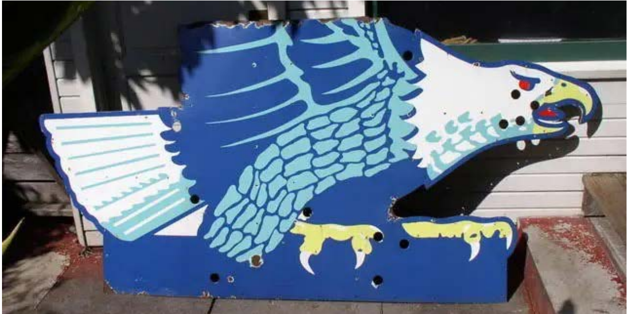
An example of a porcelain enamel sign showing the flatness and lack of detail of the design versus the hand painted version.