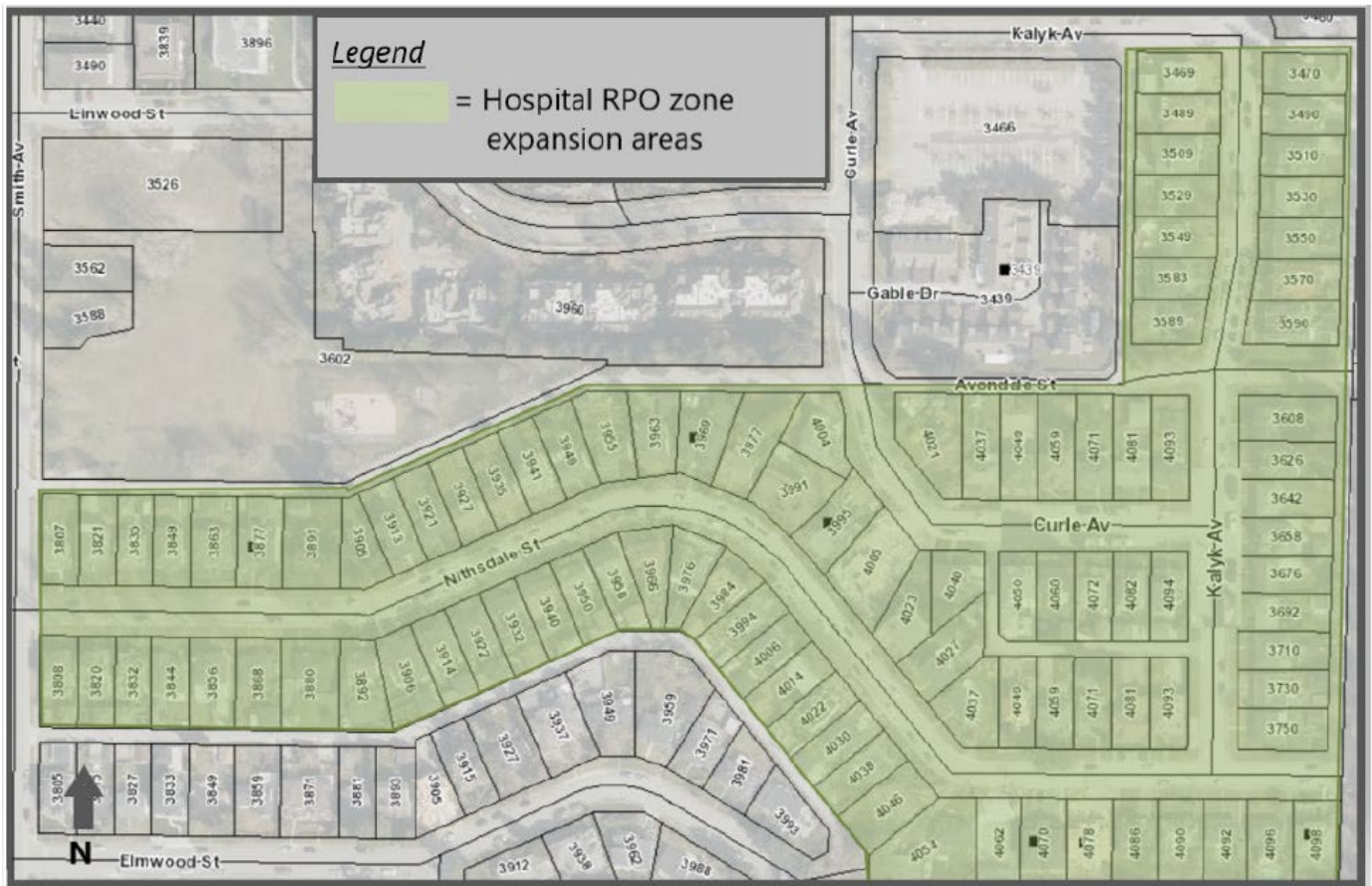
Figure 1: Resident Parking Only Study Area

The Burnaby General Hospital – Residential Parking Only (RPO) zones were updated in the year 2000 to include Kalyk Avenue, Curle Avenue, and Nithsdale Street. This was done in response to a petition presented to the Traffic and Safety Department in January 2000 with 92 supporting signatures. The zone has been in place since.