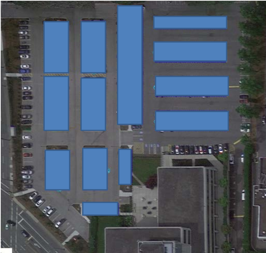
Ground Mounted PV Solar Parking Canopy Canada Way/Norland

To: Chair and Members Environment Committee From: Director Engineering Re: Update on Feasibility Study for City Hall Campus Photovoltaic Solar Installation 2021 January 12 .....Page 4