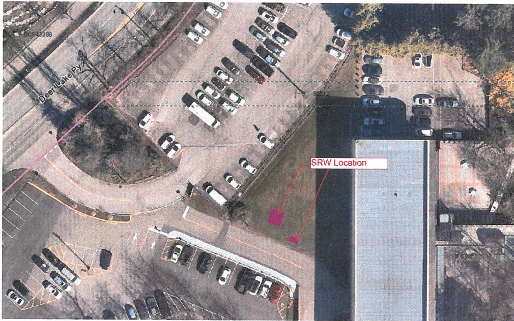
Figure 2 – Proposed Statutory Right of Way Location

To: Chief Administrative Officer From: Director Engineering Re: Request for SRW at 4949 Canada Way 2021 November 26 Page 4