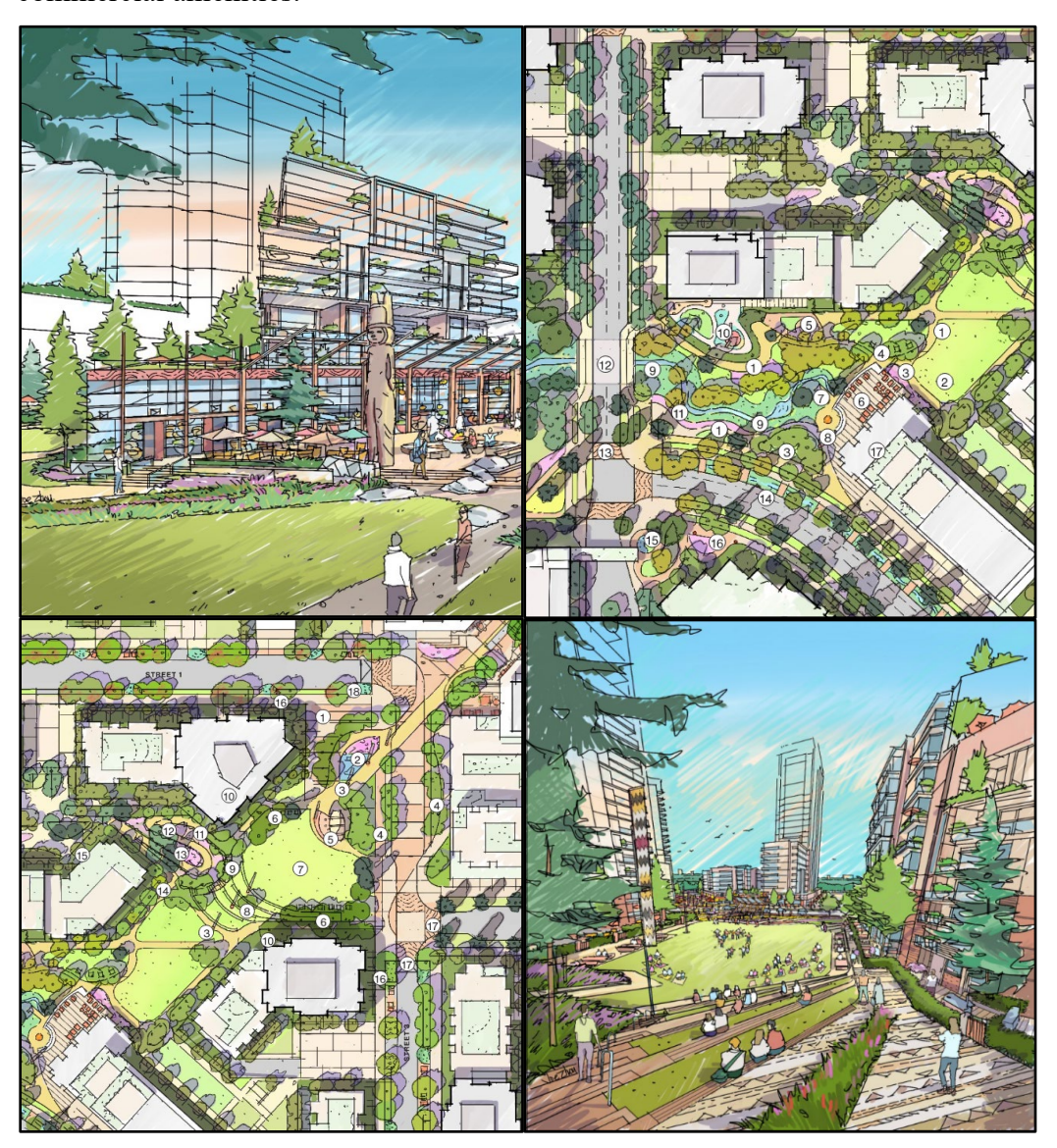
Figure 3: Cultural Heart (upper images) and Legends Park (lower images)

Deliver a mixed-use community hub that will serve not only those living and working on the Site but also those in the surrounding neighbourhoods ( Figure 3 ). The Site will provide amenities that are much needed in the area such as a grocery store, childcare, and local commercial amenities.