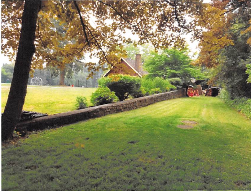
Existing Greenhouse Foundation Wall.