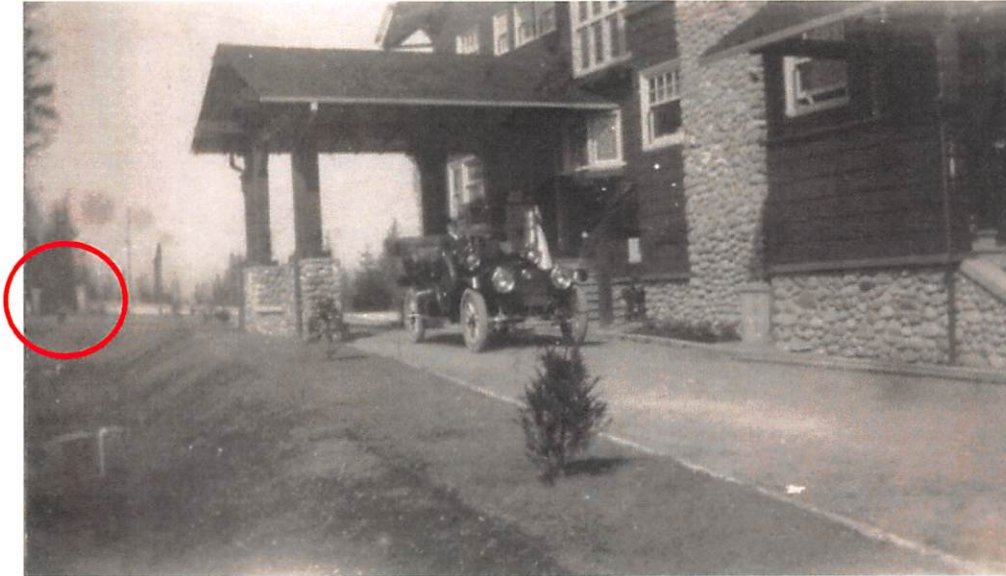
Note the estate gate visible in the background.