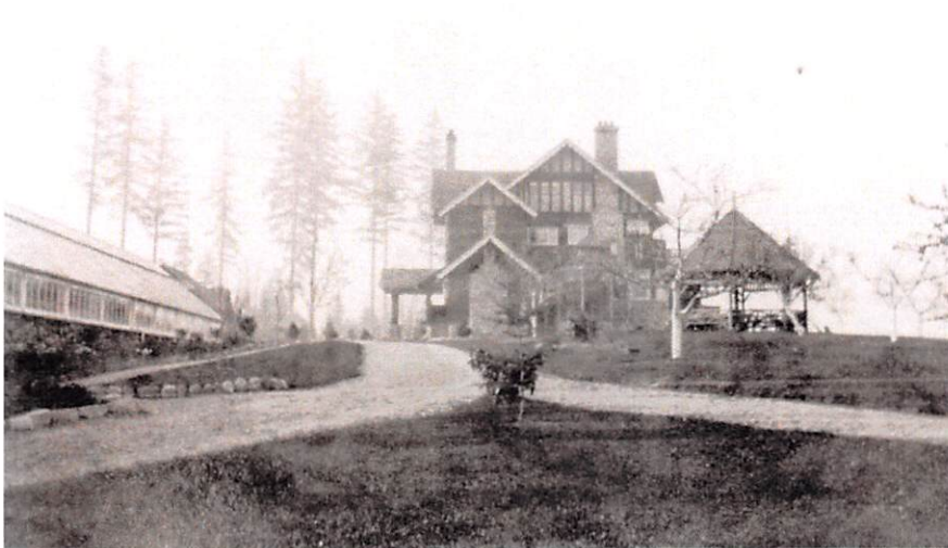
One of the Fairacres greenhouses and its foundation wall is visible on the left of the photograph, circa 1912.