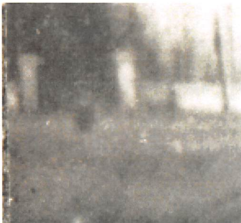
Detail of gate (enlarged historic photograph).