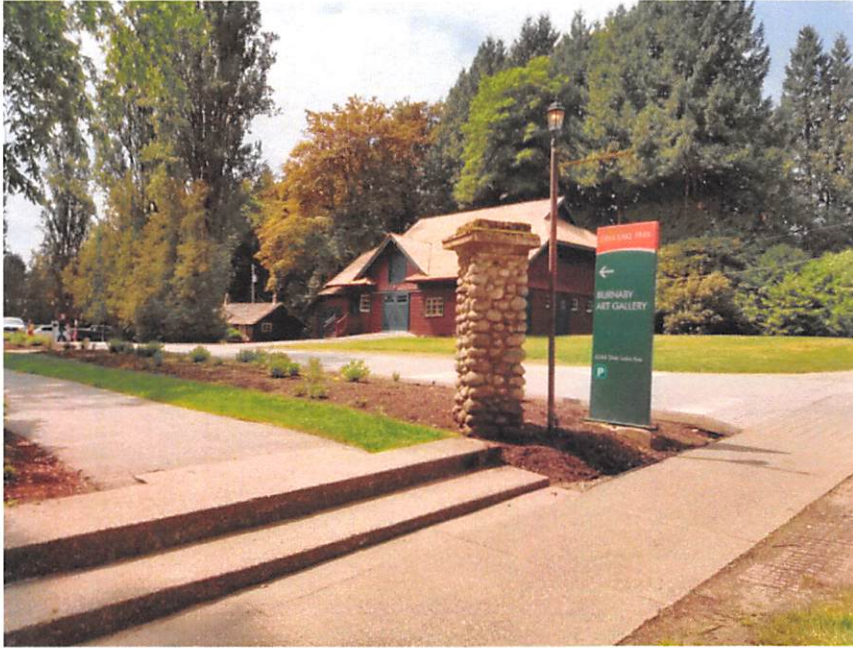
Pillar from gate marking the location of the upper driveway to the Fairacres Estate.