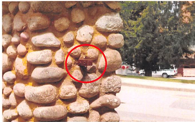
Cobblestone gate pillar. Note the anchor metal anchor that would have supported a metal gate.