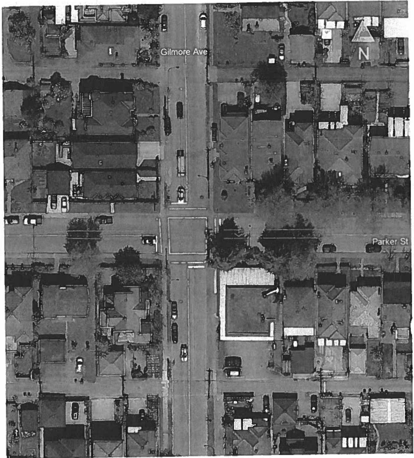
Figure 2: Recommended Intersection Geometry

To: Public Safety Committee From: Director Engineering Re: Traffic control upgrade at Parker and Gilmore 2017 November 01 ..... Page 4