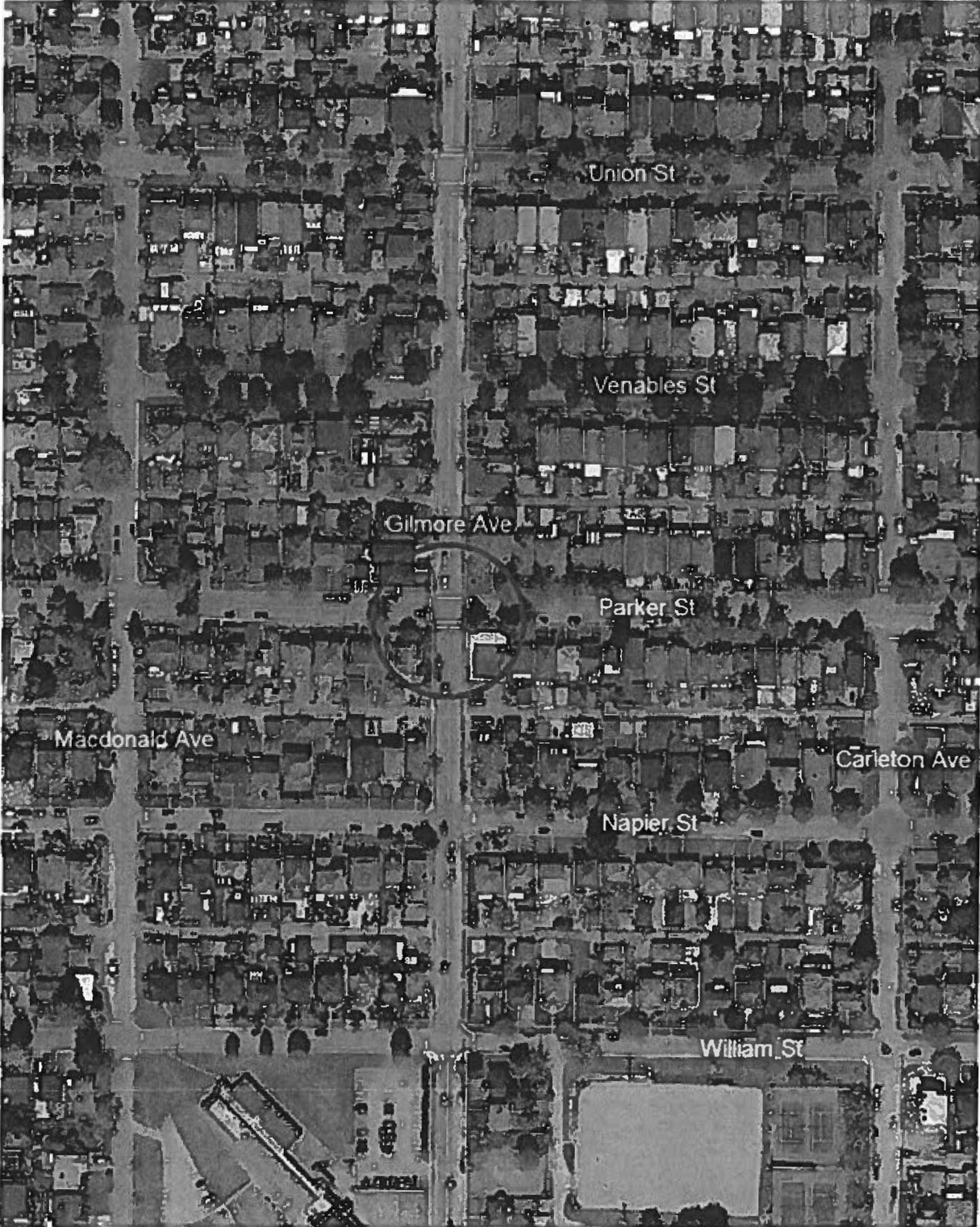
Figure 1: Location of Parker Street/Gilmore Avenue Intersection

To: Public Safety Committee From: Director Engineering Re: Traffic control upgrade at Parker and Gilmore 2017 November 01 ..... Page 2