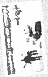
1975: Burnaby Lake Regional Park was established to protect the lake and its surroundings.

Burnaby Lake is slowly filling with silt and debris, which is a natural part of the lake's lifecycle. Today's challenge is to allow the natural process to take place while preserving the lake as an important habitat for fish and wildlife.