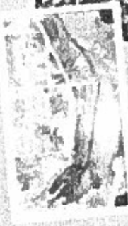
1851: Burnaby Lake in its natural state, showing a wide, shallow body of water with a sandy or rocky shoreline.

Burnaby Lake was used as a transportation route and a source of water for thousands of years by First Nations people. The water levels of the shallow lake naturally varied from high to low, with the lake expanding in size during peak rainfall periods.