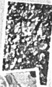
1907: The lake was filling with silt and debris, partly due to logging operations.

In the early 1900s, logging operations had removed the old growth forest surrounding the lake. Available water levels increased without the forest to absorb and store water. In 1907, built on the Burnaby River in 1905 to regulate water levels across the flow of water and by the 1920s the lake was filling with silt and debris, partly.