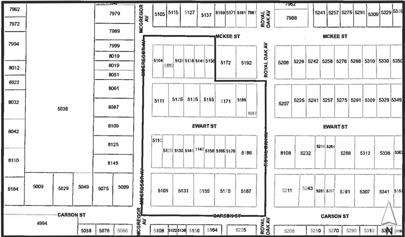
THE AREA(S) SHOWN ABOVE OUTLINED IN BLACK (——) IS (ARE) REZONED