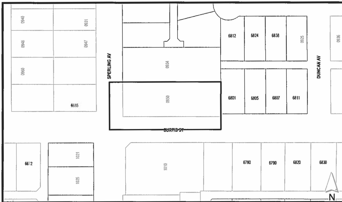
THE AREA(S) SHOWN ABOVE OUTLINED IN BLACK (————) IS (ARE) REZONED

LEGAL: Lot 5, D.L. 206, Group 1, NWD Plan 5832