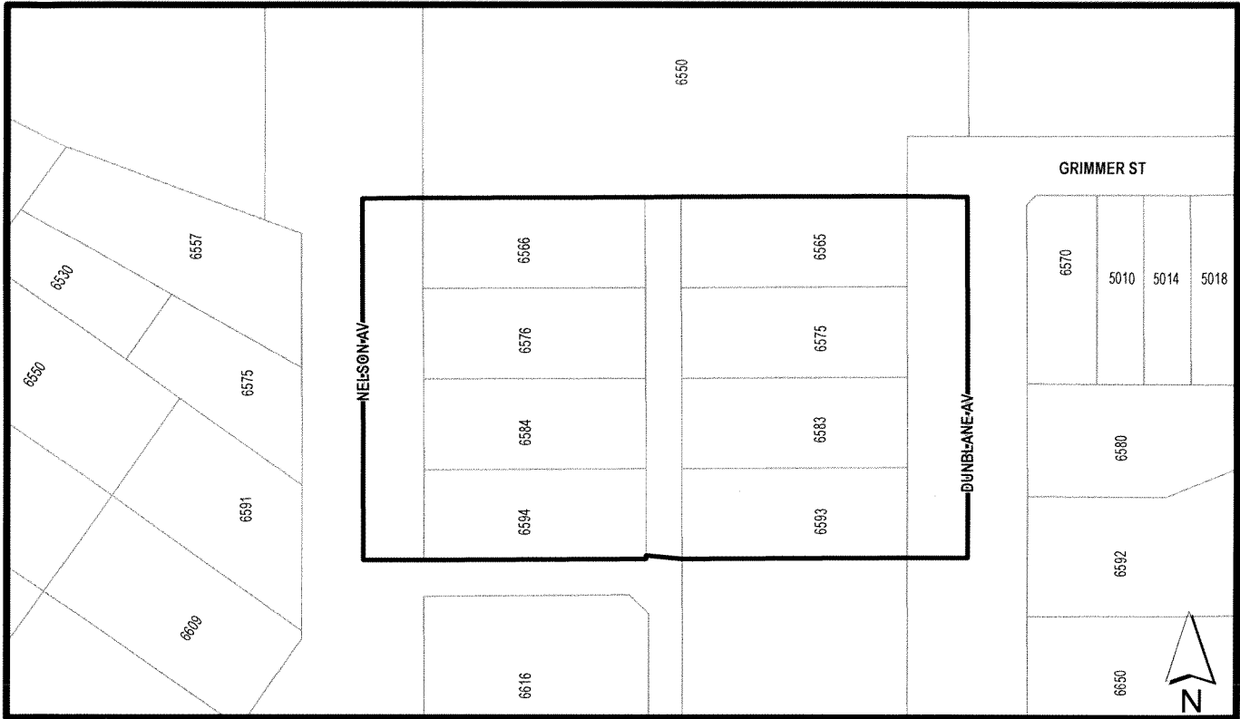
THE AREA(S) SHOWN ABOVE OUTLINED IN BLACK ( ← ) IS (ARE) REZONED

LEGAL: Lots 18/19/20/21/22/23/24/25; D.L. 152, Group 1, NWD Plan 8063