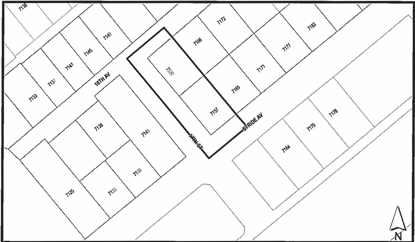
THE AREA(S) SHOWN ABOVE OUTINED IN BLACK (——) IS (ARE) REZONED

LEGAL: Parcel "A" (Exp. Pl. 14300), Lot 1, Blk 34, D.L. 53, Plan 3037, Lot 1 Except: Parcel "A": (Expl. Pl. 14300) and Road, Blk 34, D.L. 53, Group 1, NWD Plan 3037